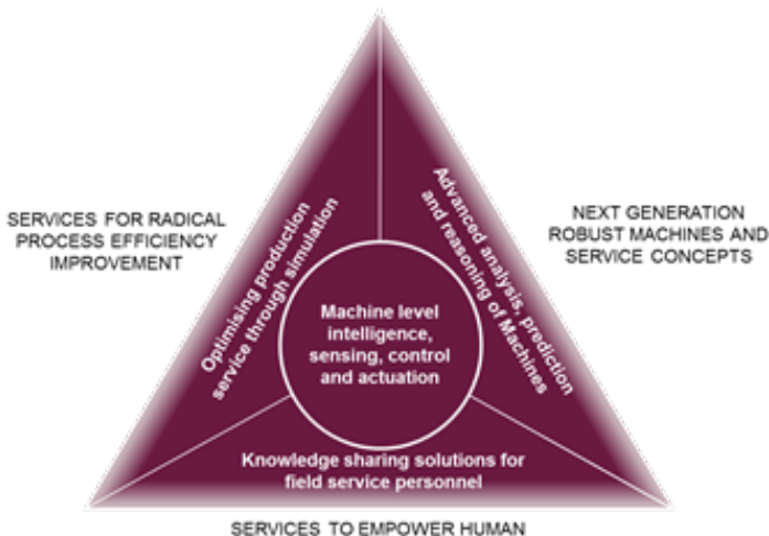
S-STEP programme structure