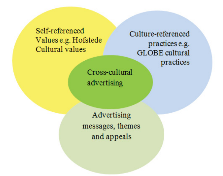
Figure 1. Positioning of the study

countries only) and sociological research (which only focuses on the impact of selected social phenomena on advertising) (Dahl 2004). In other words, the purpose of cross-cultural advertising research is to establish that cultural values are a predictor of the reflection of and preference for particular advertising contents. This category of research to some extent provides a broader view of the impact of culture on advertising in a predictable manner. This study is mainly positioned to contribute to cross-cultural advertising research. The positioning of the thesis is presented in Figure 1.